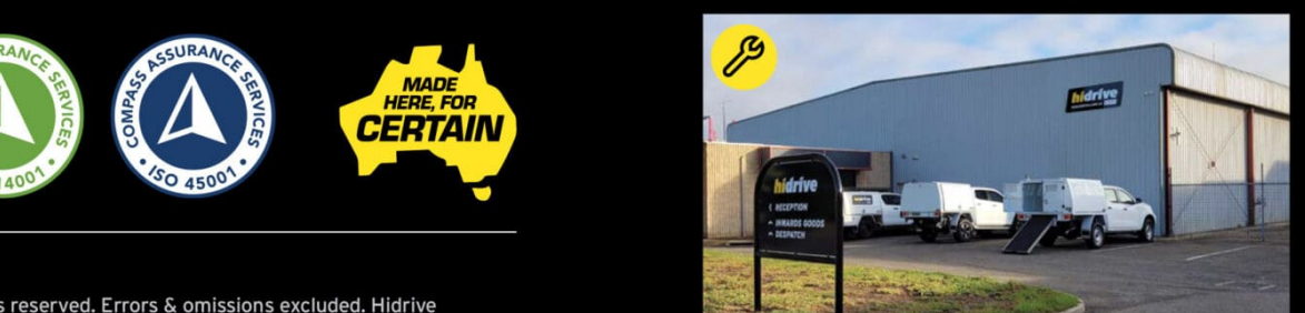
Adelaide Showroom & Installation 6 Wirriga St, Regency Park SA 5010