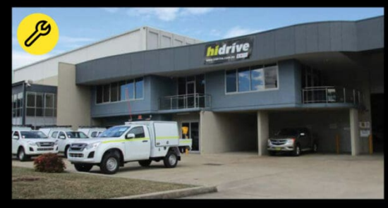
Sydney Showroom & Installation 10 Garner PI, Ingleburn NSW 2565