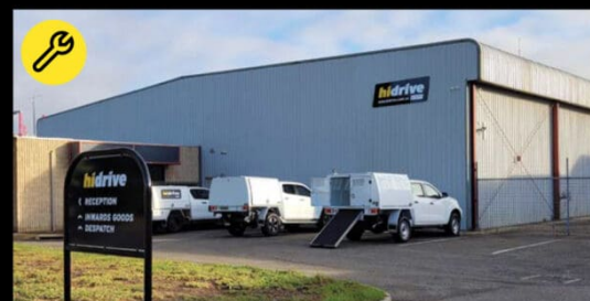
Adelaide Showroom & Installation 6 Worriga St, Regency Park SA 5010