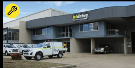
Sydney Showroom & Installation 10 Garner Pl, Ingleburn NSW 2565