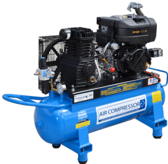
DIESEL AIR COMPRESSOR TRADITIONAL 420lpm / 100psi