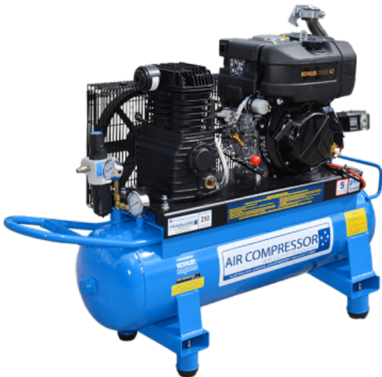
DIESEL AIR COMPRESSOR TRADITIONAL 420lpm / 100psi