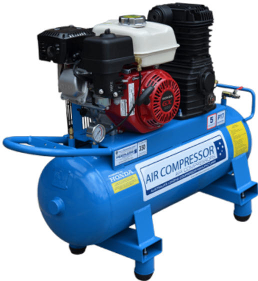
PETROL AIR COMPRESSOR TRADITIONAL 420lpm / 100psi