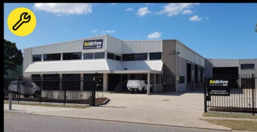
Brisbane Showroom & Installation 146 Crockford St, Northgate QLD 4013