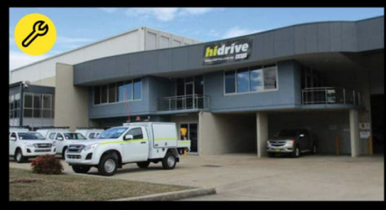
Sydney Showroom & Installation 10 Garner PI, Ingleburn NSW 2565