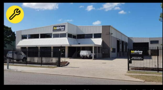
Brisbane Showroom & Installation 146 Crockford St, Northgate QLD 4013