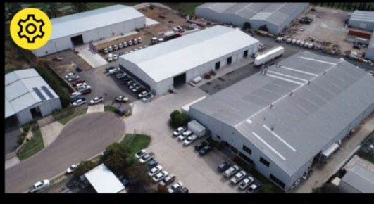
Eastern Manufacturing, Installation & Showroom 17 O'Sullivan Pl, Goulburn NSW 2580

Hidrive is the only manufacturer of service bodies for utes, trailers and trucks with a company-owned national installation network.