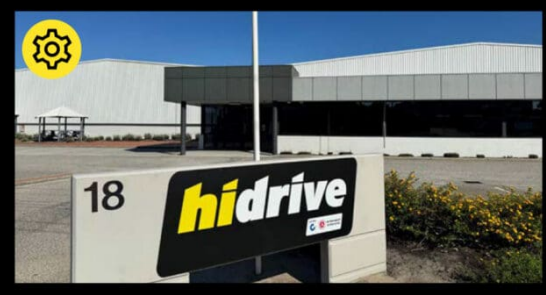
Western Manufacturing, Installation & Showroom 18 Catalano Rd, Canning Vale WA 6155