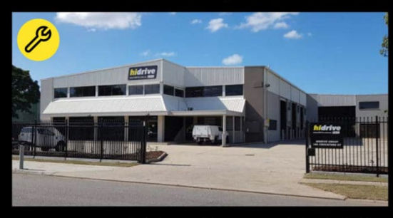
Brisbane Showroom & Installation 146 Crockford St, Northgate QLD 4013