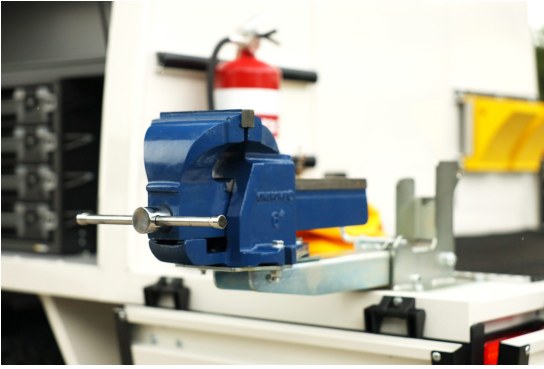
SLIDING VICE HOLDERS With 100mm Vice