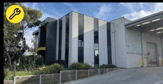
Melbourne Showroom & Installation 57 Hunter Rd, Derrimut VIC 3026