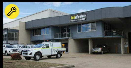
Sydney Showroom & Installation 10 Garner Pl, Ingleburn NSW 2565