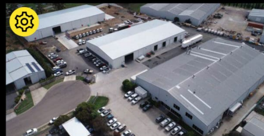
Eastern Manufacturing, Installation & Showroom 17 O'Sullivan Pl, Goulburn NSW 2580