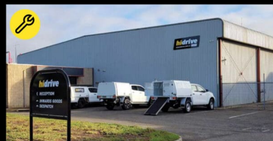
Adelaide Showroom & Installation 6 Worriga St, Regency Park SA 5010