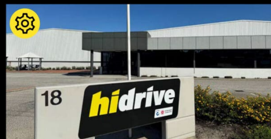
Western Manufacturing, Installation & Showroom 18 Catalano Rd, Canning Vale WA 6155