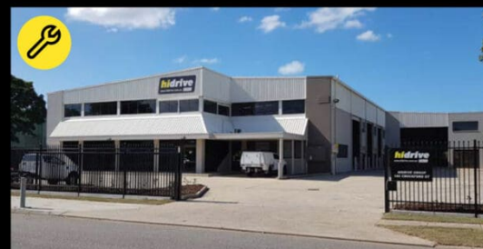
Brisbane Showroom & Installation 146 Crockford St, Northgate QLD 4013