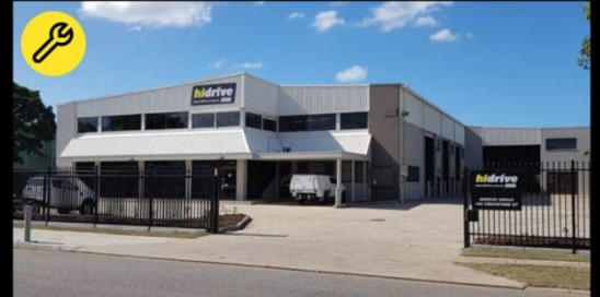
Brisbane Showroom & Installation 146 Crockford St, Northgate QLD 4013