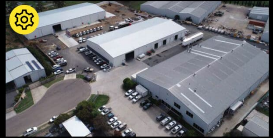
Eastern Manufacturing, Installation & Showroom 17 O'Sullivan Pl, Goulburn NSW 2580