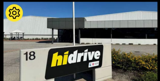
Western Manufacturing, Installation & Showroom 18 Catalano Rd, Canning Vale WA 6155