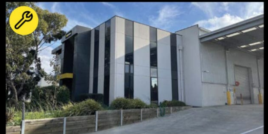
Melbourne Showroom & Installation 57 Hunter Rd, Derrimut VIC 3026