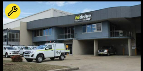
Sydney Showroom & Installation 10 Garner Pl, Ingleburn NSW 2565