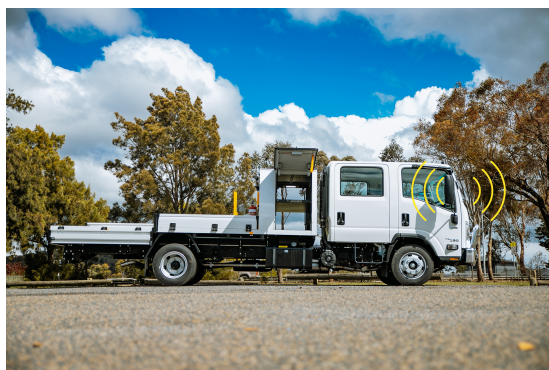
DOOR AJAR ALARM (TRUCK) No handbrake sensor