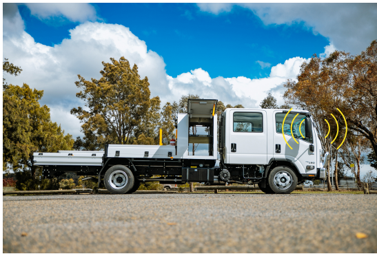
DOOR AJAR ALARM (TRUCK) With handbrake sensor