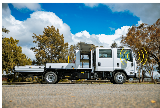
DOOR AJAR ALARM (TRUCK) With handbrake sensor