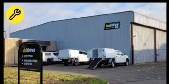
Adelaide Showroom & Installation 6 Worriga St, Regency Park SA 5010