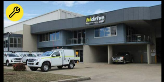
Sydney Showroom & Installation 10 Garner Pl, Ingleburn NSW 2565