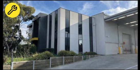
Melbourne Showroom & Installation 57 Hunter Rd, Derrimut VIC 3026