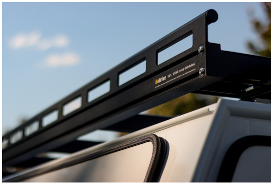
PIPE RACK (TRUCK) W450 x L3200mm