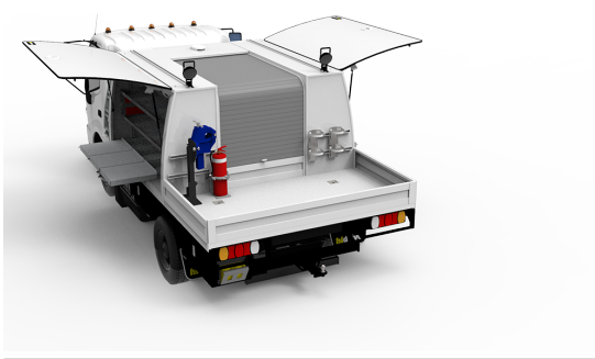
CENTRE AISLE ROLLER SHUTTER (TRUCK) W700mm