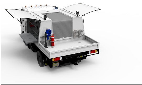
CENTRE AISLE ROLLER SHUTTER (TRUCK) W1000mm