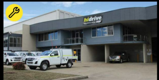
Sydney Showroom & Installation 10 Garner Pl, Ingleburn NSW 2565