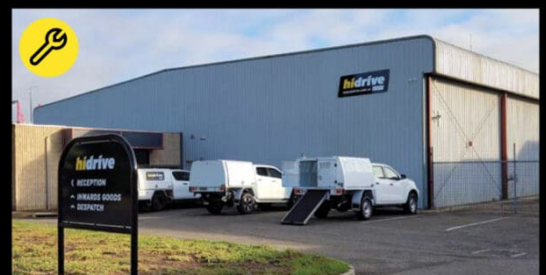
Adelaide Showroom & Installation 6 Worriga St, Regency Park SA 5010