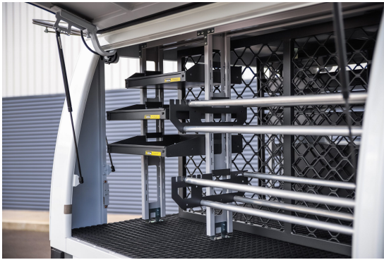
ONE-CLICK ADJUSTABLE CABLE REEL HOLDER (TRUCK) L920mm