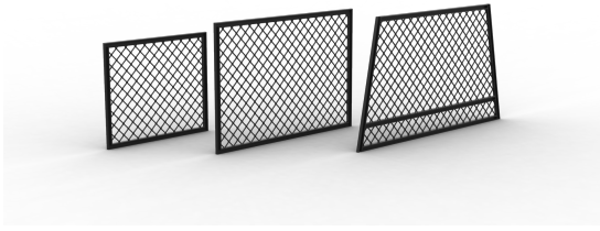
TAPERED MESH PANEL DIVIDER (TRUCK) L1900 x H1350mm