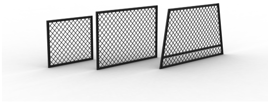
TAPERED MESH PANEL DIVIDER (TRUCK) L1700 x H1350mm