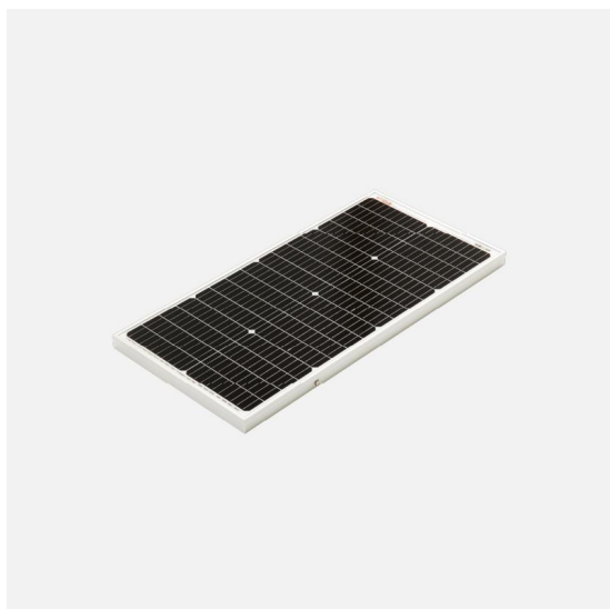
SOLAR PANEL (TRUCK) 60W