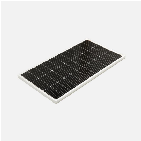
SOLAR PANEL (TRUCK) 180W