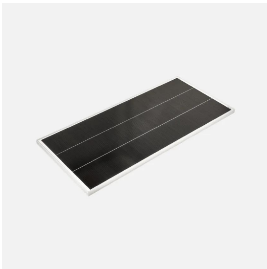
SOLAR PANEL (TRUCK) 200W