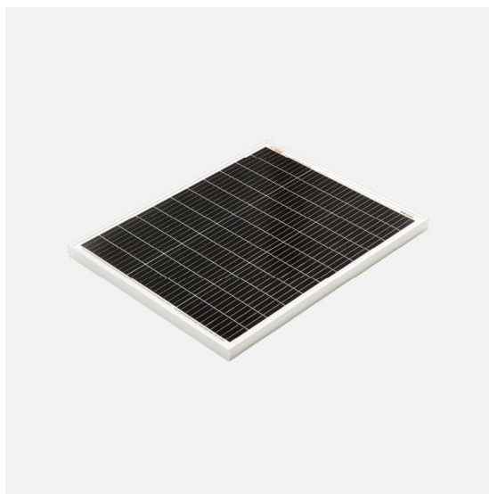
SOLAR PANEL (TRUCK) 80W