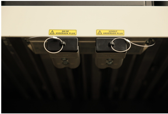
JUMPSTART RECEPTACLE (TRUCK) Dual battery, 12V