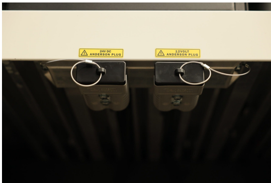
JUMPSTART RECEPTACLE (TRUCK) Crank battery