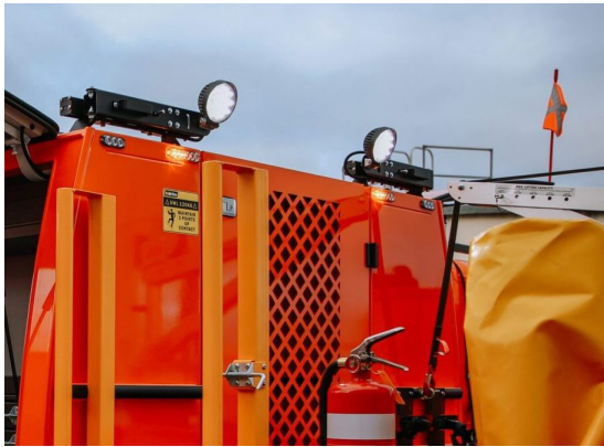
FOLDING WORK LIGHT BRACKET 250mm