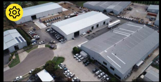
Eastern Manufacturing, Installation & Showroom 17 O'Sullivan Pl, Goulburn NSW 2580