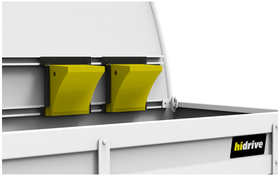
WHEEL CHOCKS & BRACKET (TRUCK) 750mm rolling diameter