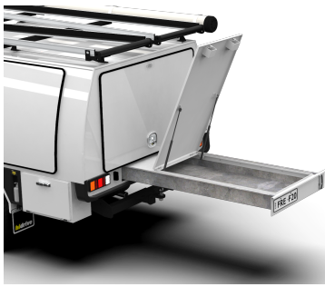
REAR ROLLER DRAWER LID L1920mm