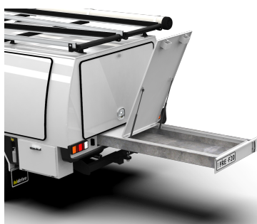
REAR ROLLER DRAWER LID L1920mm