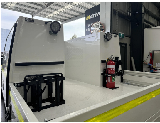
JERRYCAN SAFETY HOLDER Lockable jerrycan holder with steel frame