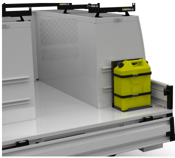
JERRYCAN SAFETY HOLDER Jerrycan safety holder with straps (not lockable)