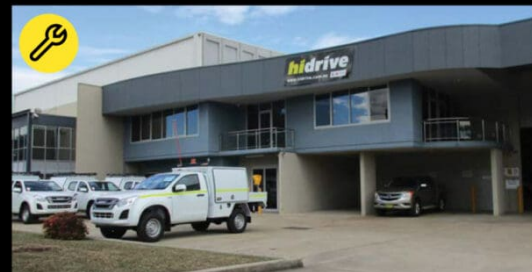
Sydney Showroom & Installation 10 Garner Pl, Ingleburn NSW 2565