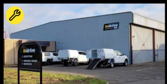
Adelaide Showroom & Installation 6 Wirriga St, Regency Park SA 5010