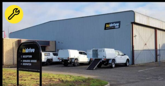
Adelaide Showroom & Installation 6 Worriga St, Regency Park SA 5010