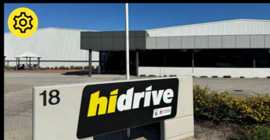
Western Manufacturing, Installation & Showroom 18 Catalano Rd, Canning Vale WA 6155