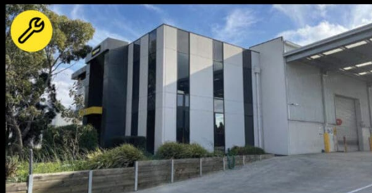
Melbourne Showroom & Installation 57 Hunter Rd, Derrimut VIC 3026