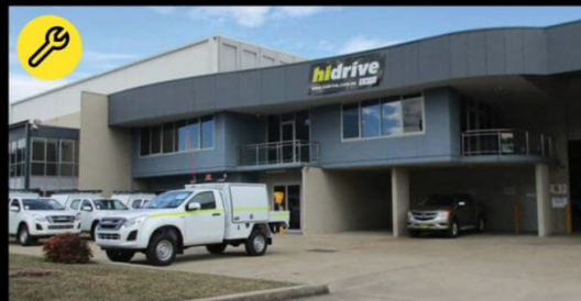
Sydney Showroom & Installation 10 Garner Pl, Ingleburn NSW 2565