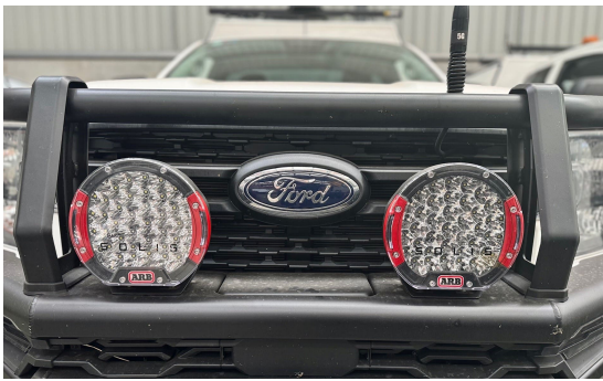
DRIVING LIGHTS, ROUND Halogen