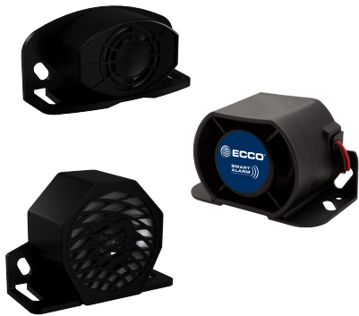
REVERSE ALARM Broadband quacker, 92dB