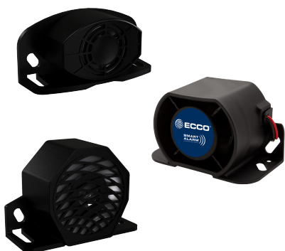
REVERSE ALARM Smart reverse alarm, auto adjusts output to 10dB above surrounding sound level