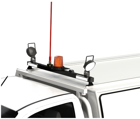
ROPS CELL, VEHICLE SPECIFIC Toyota Landcruiser