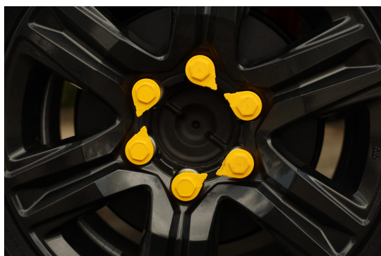
WHEEL NUT INDICATORS 19mm 38mm ext