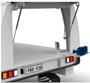
FOLD DOWN VICE HOLDER With 150mm Vice