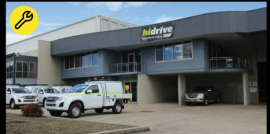
Sydney Showroom & Installation 10 Garner Pl, Ingleburn NSW 2565