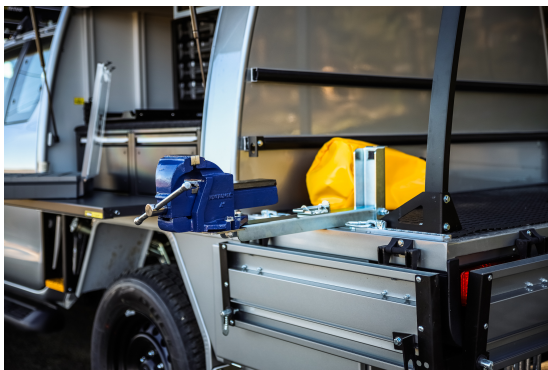
FOLD DOWN VICE HOLDER With 100mm Vice