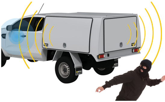
SECURITY ALARM, FITTED TO SERVICE BODY (TRAILER) 12V