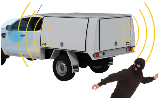
SECURITY ALARM, FITTED TO SERVICE BODY (TRAILER) 24V