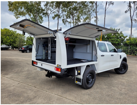
DOOR AJAR ALARM With handbrake sensor