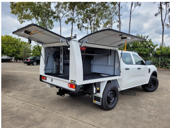
DOOR AJAR ALARM No handbrake sensor