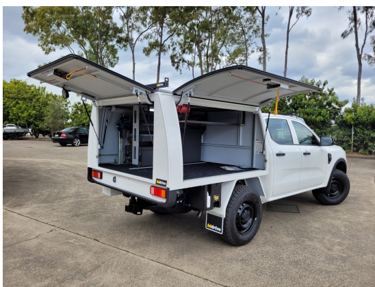
DOOR AJAR ALARM With handbrake sensor