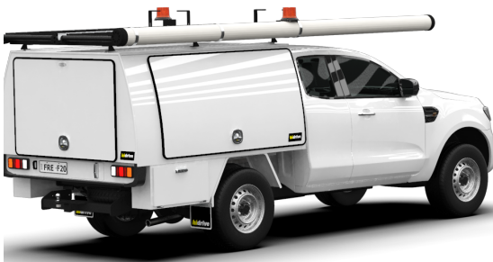
CONDUIT CARRIER, WITH LOCKING CAPS 150 Dia x L4100mm