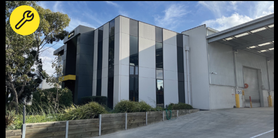
Melbourne Showroom & Installation 57 Hunter Rd, Derrimut VIC 3026