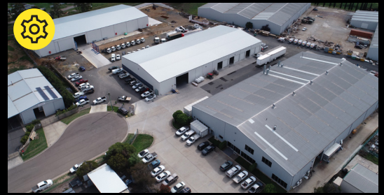
Eastern Manufacturing, Installation & Showroom 17 O'Sullivan Pl, Goulburn NSW 2580