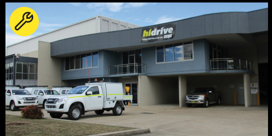
Sydney Showroom & Installation 10 Garner Pl, Ingleburn NSW 2565