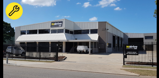
Brisbane Showroom & Installation 146 Crockford St, Northgate QLD 4013