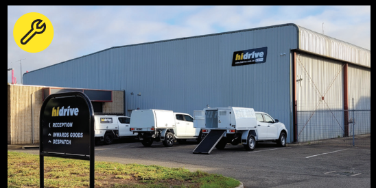
Adelaide Showroom & Installation 6 Wirriga St, Regency Park SA 5010