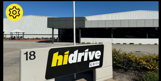
Western Manufacturing, Installation & Showroom 18 Catalano Rd, Canning Vale WA 6155